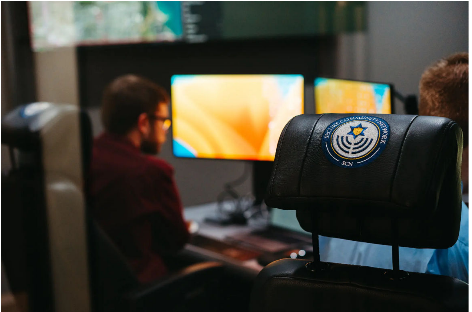
The command center of the Secure Community Network is staffed with analysts who have backgrounds in the military, private intelligence and social media companies.

The broad... in... eyville, Texas, sits on display in the offices of the Secure Community Network.