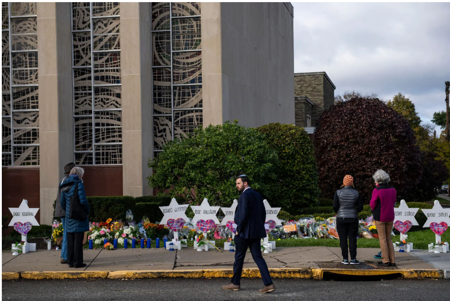
Mourners at the Tree of Life synagogue in Pittsburgh in 2018. The shooting killed 11 worshipers and was the deadliest antisemitic attack in American history.

In a report released in March, the Anti-Defamation League counted 3,700 instances of antisemitic harassment, vandalism or assault around the country last year alone, the highest number in 43 years of keeping track. The F.B.I. has also found hate crimes on the rise; of religiously motivated hate crimes, nearly two-thirds were targeted at Jews.