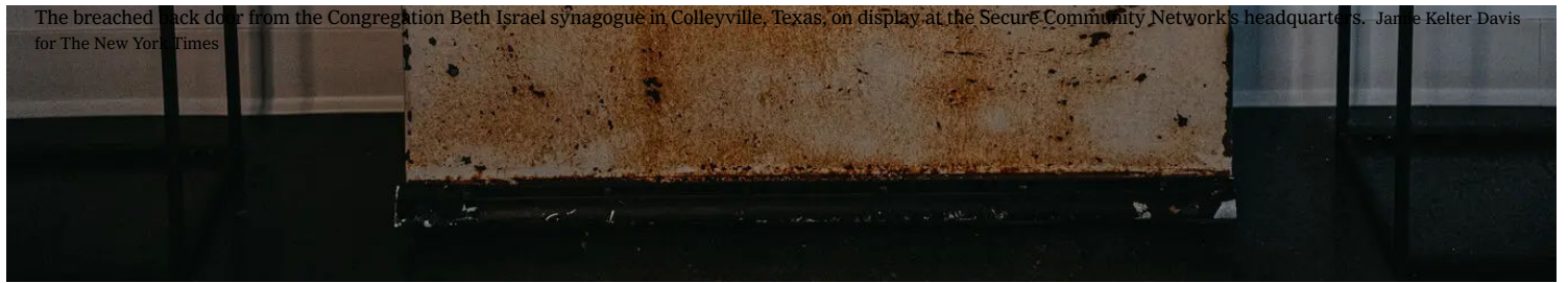
The breached back door from the Congregation Beth Israel synagogue in Colleyville, Texas, on display at the Secure Community Network's headquarters.